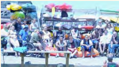
The 2007 Mount Sinai Spinal Cord Injury Life Challenge Program Kayak Participants.

On Saturday, June 30th, representatives from AVM-Bethpage, NY, joined over 35 people with disabilities, their families, therapists, friends and volunteers for the Mount Sinai Spinal Cord Injury Life Challenge Program Kayaking Trip, held in conjunction with Empire Kayaks in Island Park, NY.