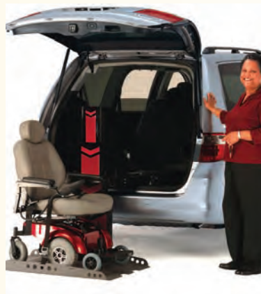
Vantage Mobility International Elite Lift

* Please note prices vary depending on model and options chosen.