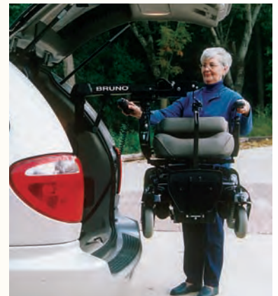
Bruno VSL Scooter Lift

For more information on any of these products, please feel free to contact an AVM sales representative.