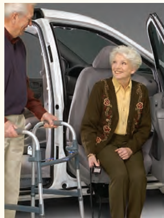
Braun Companion Seat THE BRAUN CORPORATION

Minivans ■ SUVs ■ Pick-up Trucks Prices range from $1,595- $6,995